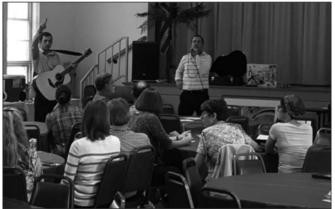
Photos from our first Temple auction held September 25, 2016.