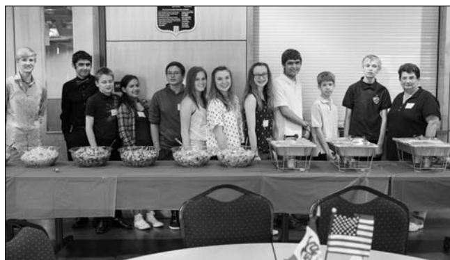
Temple B'nai Jeshurun Youth Group helps Iowa Jewish Historical Society at Taste of Jewish Cooking

Another wonderful project we have been working on is helping out at the Cemetery. How are we doing this you might ask? We are gathering pots and filling them with River Rock and placing them in certain areas of the